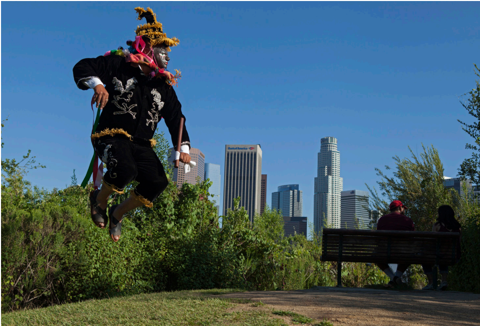
A Zapotec dancer in downtown Los Angeles.

ourselves up by our bootstraps” American exceptionalism and ignores the atrocious treatment that Native people have and continue to endure.