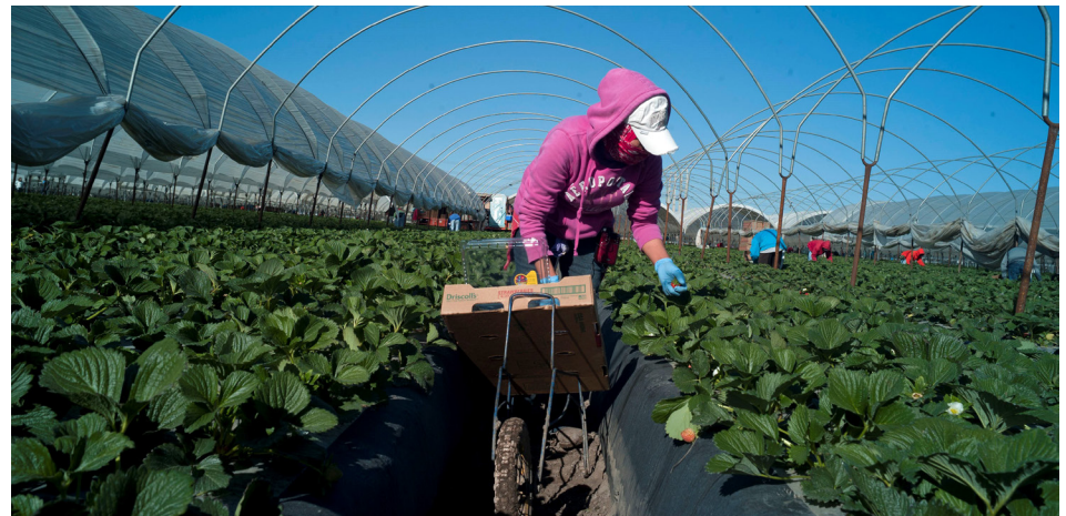
Indigenous women strawberry pickers. Photo by Antonio Nava.

Invisibilization stealthily never acknowledges the existence of Native people in real-time. Calling this a "nation of immigrants" upholds the "pull