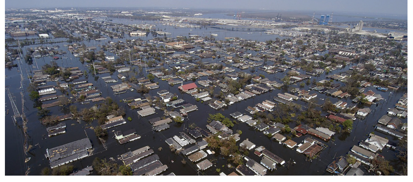
New Orleans underwater after Hurricane Katrina

day value of that loss. At this point, only 2% of farmland, across the entire United States, is owned by Black Americans. And climate change is further deepening risk for farmers. "Global warming does not discriminate, but the system that prepares farmers for it does."