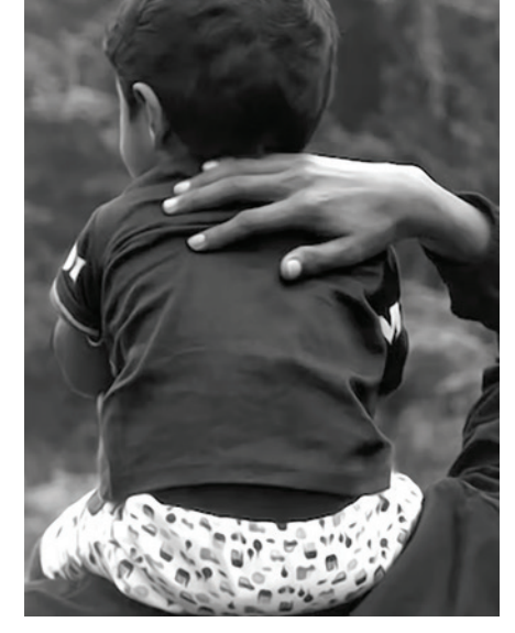
ICWA set the standard for protecting children's well-being.