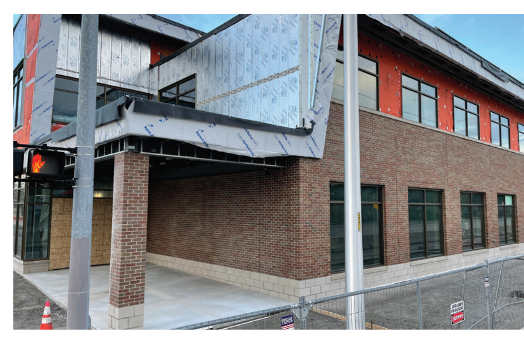
The Detroit Food Commons, under construction.

We hear stories of disinvestment like this from Climate Justice Alliance's 89 member organizations and others in the movement who are building climate justice solutions all across the country. The excuses to not fund our work run the gamut (and come from investors and funders alike); they rely on myths that claim that community-led projects are not "ready" for financing or "financially viable,